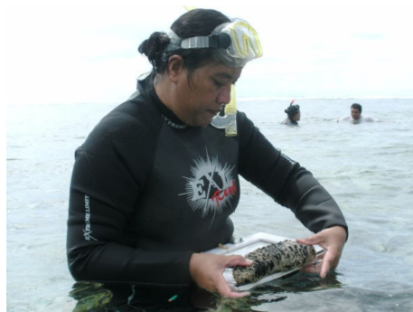
Measures of sea cucumbers, Samoa, May 2012