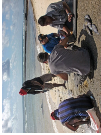
Collecting data from fishermen when they land their catch during a creel survey, Nauru, June 2012