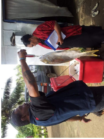
Harvesting market data in Tonga, August 2012