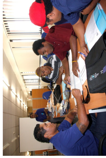
PIRFO Assessor's workshop, Noumea, New Caledonia, August 2012