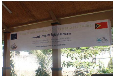
Ceremony of delivery of the “Guide & Information sheets for fishing communities - Guide to information sheets on fisheries management for communities”, Dili, Timor Leste, August 2012