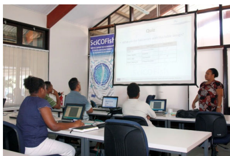
Training on database fundamentals for coastal fisheries, Noumea, New Caledonia, March 2012