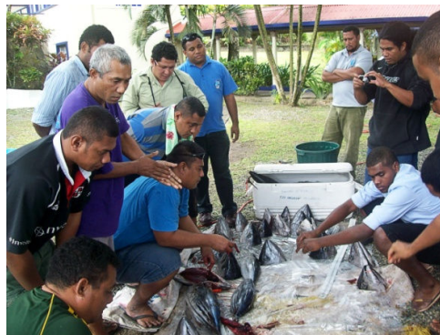
Biological sampling during subregional observers training, Suva, Fiji, May-June 2012