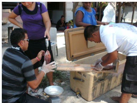
Collecting biological data from roadside fish vendors, Tarawa, Kiribati, May 2012