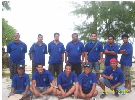
Trainees, longline observer training course, Tarawa, Kiribati, November 2012

technical guide for purse seine — were developed, and sampling material was provided for the sub-regional and national observer programmes.